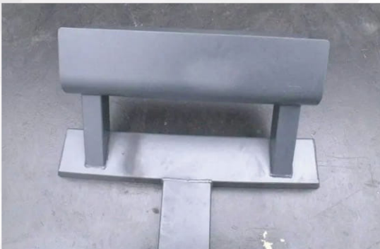
Wide Foot Bar