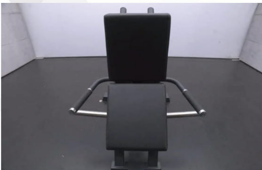
Durable Build with Angled Hand Grips