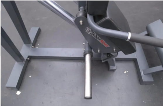
Steel weight peg