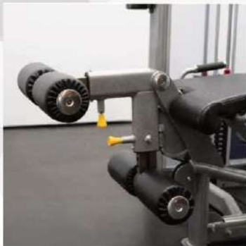
Adjustable Leg Roller