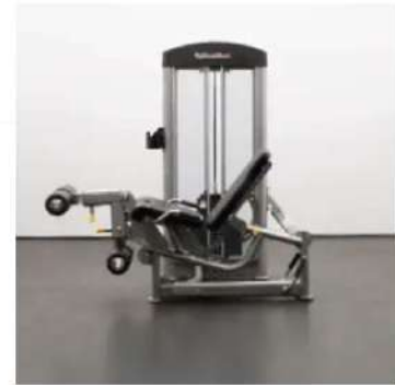
Multiple Starting Positions