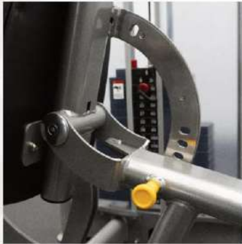
Angled Pads and Ideal Pivot Location Promote full muscle contraction and alignment