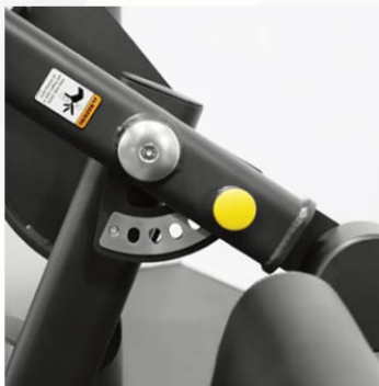
Range-of-Motion Adjustment in 10-degree Increments Allows users a safe range of exercise