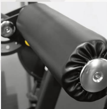
Lumbar Pad Helps users easily find correct position relative to axis of rotation