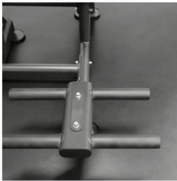
Two Different Foot Platforms To accommodate both exercises and all users