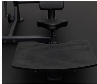
Wide Adjustable Footplate