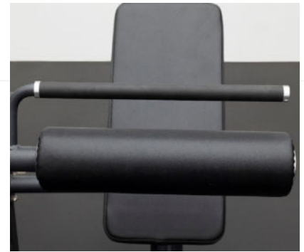
Handle Bar for Support