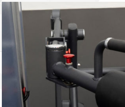
Swinging Arm for Easy Access