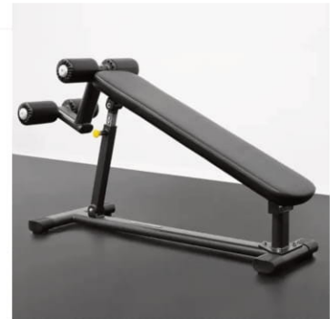
Longer/Wider Backrest For Added Comfort