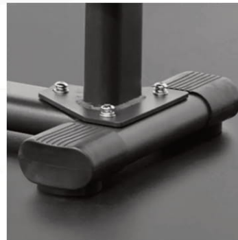
Rubber End Caps and Feet Added to protect flooring