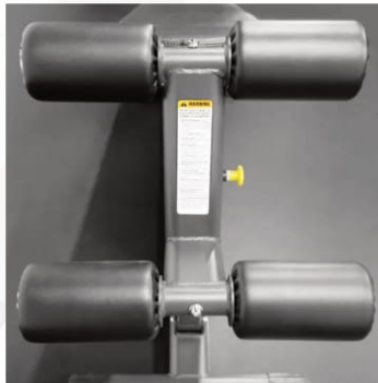
Heavy Padded 2 Level Rollers