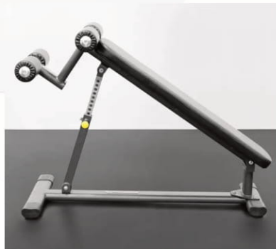
Durable Construction With powder coat exterior finish to protect against wear and tear