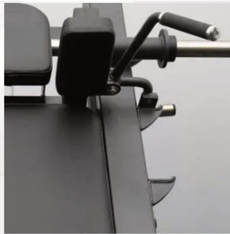
2 Safety Locking Points With easy to reach and operate safety stops