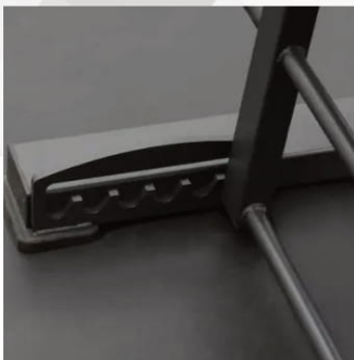
6 Position Adjustable Angle On foot plate to suit every user