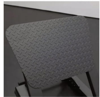
Large Non-Slip Foot Plate Allows user to define proper foot placement