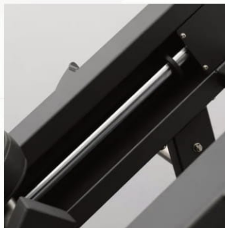
Linear Bearing Guide Rods Resist rust and provide smooth carriage operation