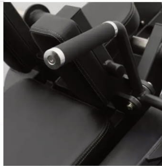
Integrated Rubber Handles For safe entry and exit