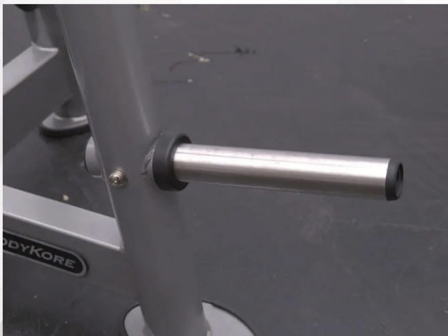
12 Stainless Steel Pegs