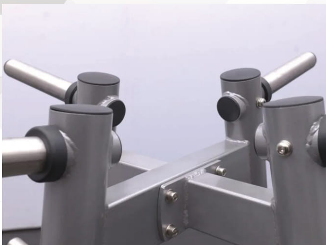
Even Distribution Eliminates the Risk of Tipping